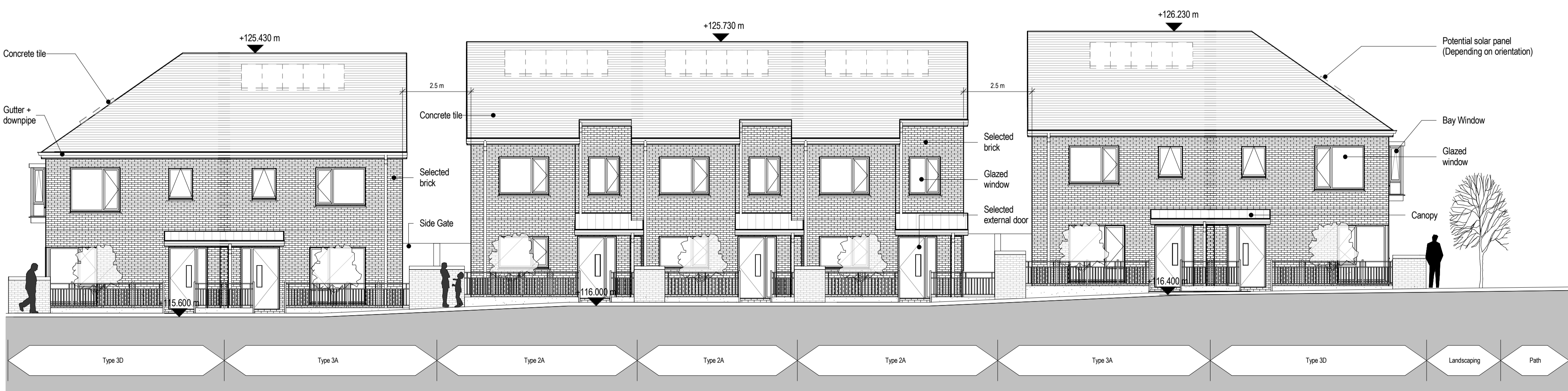
3 Contextual Elevation - FF 1:100