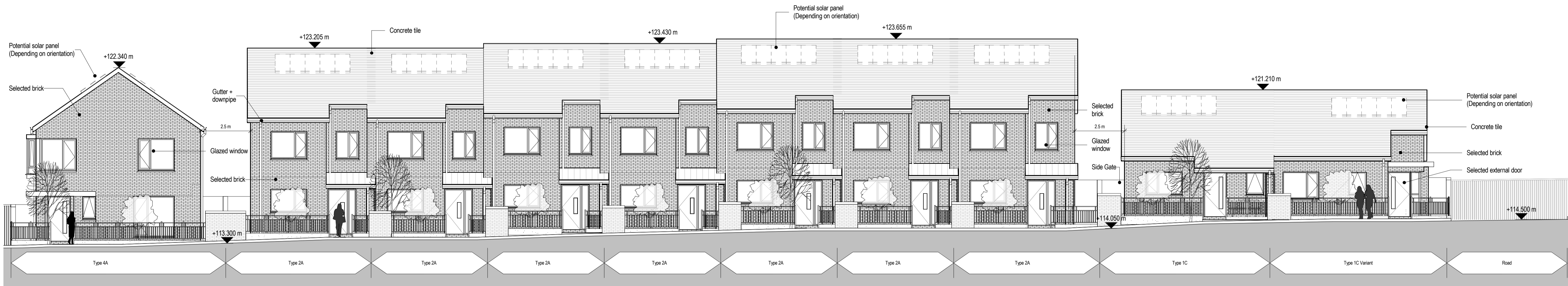
2 Contextual Elevation - EE 1:100