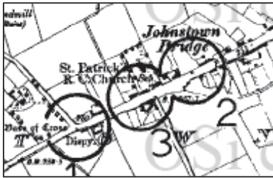
Fig. 1 sample SMR site in Johnstownbridge.