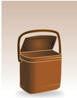
+ kitchen caddy

Some collectors might provide you with a kitchen caddy