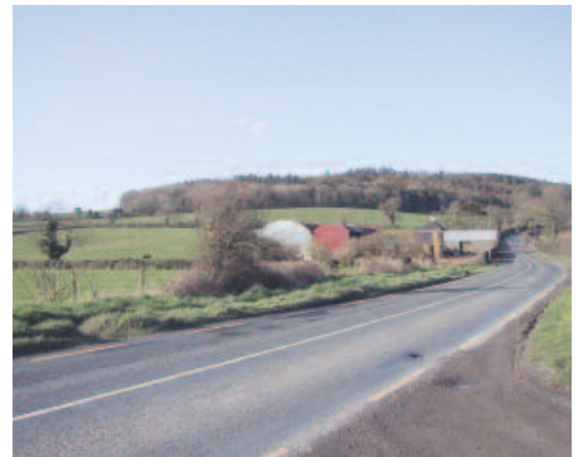
The Liffey at Ballymore Eustace

The grasslands of the Curragh, the uplands of East Kildare, the boglands of North-west Kildare and the valleys of the Barrow and the Liffey form a contrasting landscape character. Although much of the county is low-lying, it is rare that the presence of upland areas or undulating countryside is far away.