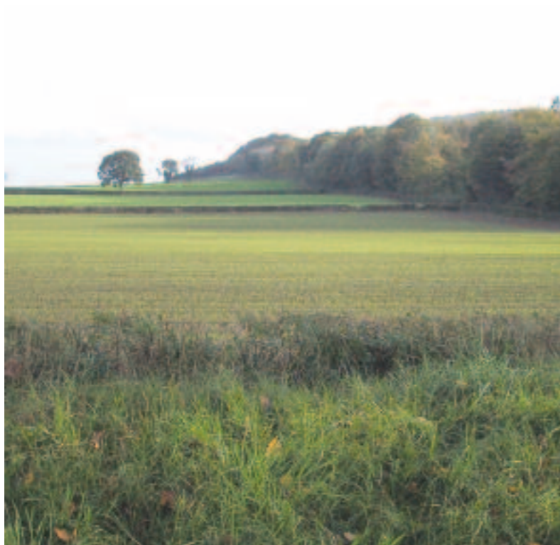
Strong edge to woodland area, near Kilkea

Woodland and Forest areas, such as Donadea are seen as recreational areas of importance. They are, of course another vital element in the overall landscape structure. They can help in siting buildings below the landscape and the tree line, but they also need to be read at their edges as clearly defined landscape components and more than a backdrop for houses.