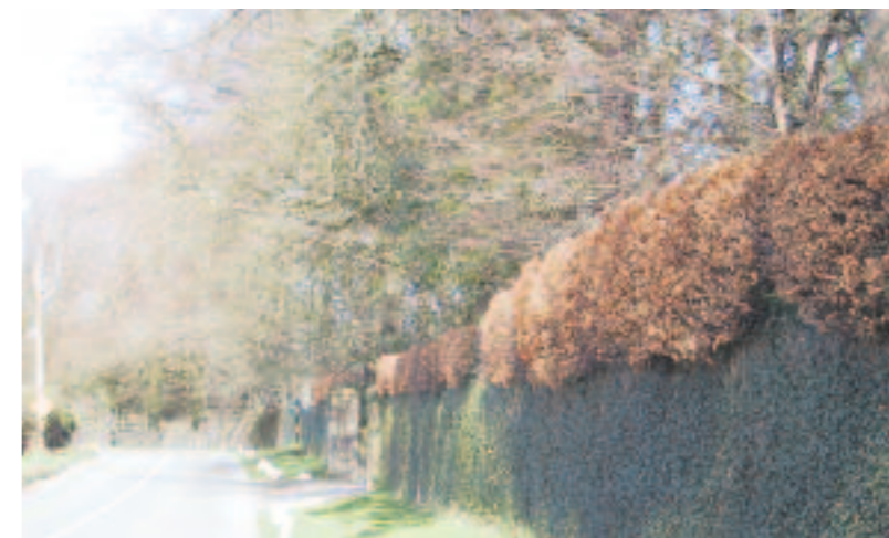
Beautiful roadside treatment, with verge, wall, hedge and trees, Rathmore

There is a diversity of character in the designated High Amenity Areas, but a common concern that the evolution of these areas over a great length of time could be obscured by insensitive development.