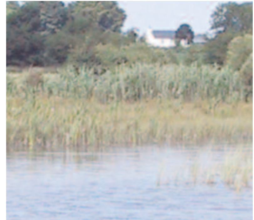
Ballynafagh Lake – Boglands close to Prosperous