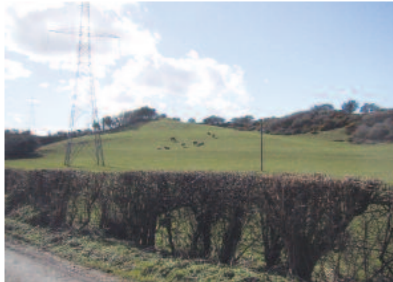
Upland farm near Ballymore Eustace