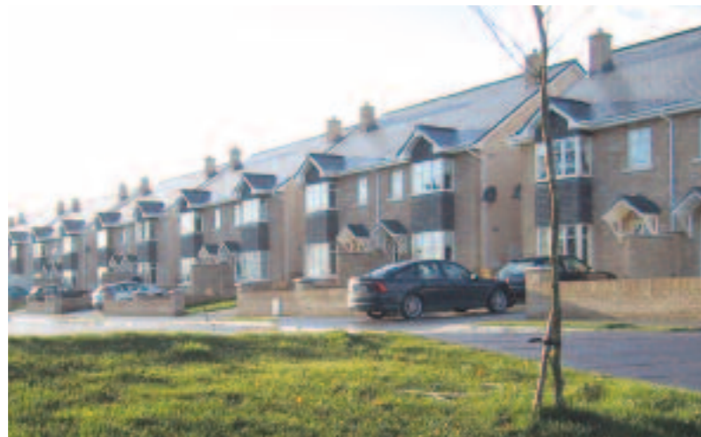
Higher densities and suburban forms at Kilcullen

In recent times, extensive areas of land have developed as 'the urban countryside,' this is problematic because it blurs the definition between town and country and swallows up large areas of agricultural landscape.