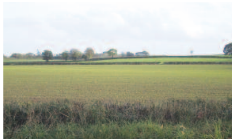
Very large fields in the South create an open, featureless landscape through loss of hedgerows

An open, flat or gently rolling landscape is vulnerable to development, even of a modest scale because its visibility is high and impacts over a considerable distance. It is difficult to minimise the impact of development with landscaping in a stand-alone location with high visibility. It can be particularly problematic where the number of houses suggests a suburban rather than a rural landscape. Thus open landscape areas like the Curragh and areas in the South of the County are vulnerable to development.