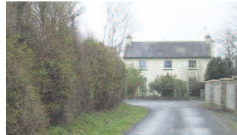
Effective hedging creates shelter and screening, near Pollardstown

In such low-lying areas the landscape structure is able to accept a certain level of development without having a profound impact on the countryside character. However, it is vital to consider landscape-sensitive siting, screening and sheltering.