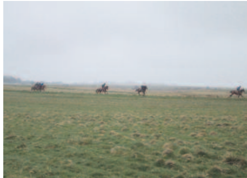
Horses on the Curragh