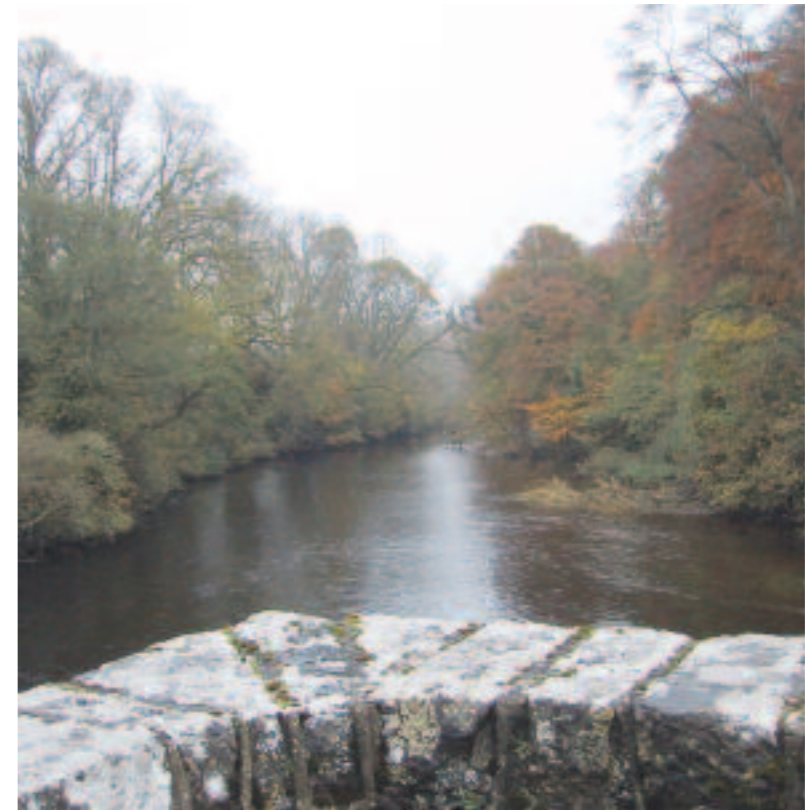
The river Liffey near Bodenstown

The river valleys have always provided an attractive location for houses and settlement, but they are also areas of important biodiversity and wildlife and are of great value visually. Therefore a careful balance between essentially competing uses needs to be maintained.