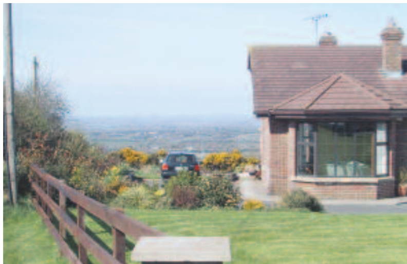
A stunning view over County Kildare, but very obtrusive location for a house on a ridge in the landscape, Killeel