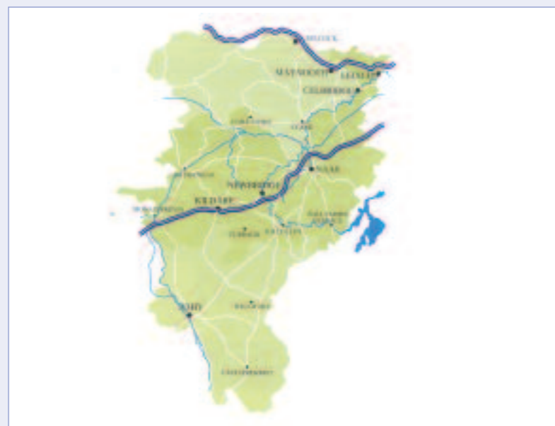
Map 1.1 Towns, Rivers, Canals, Boglands, Plainlands and Uplands of County Kildare